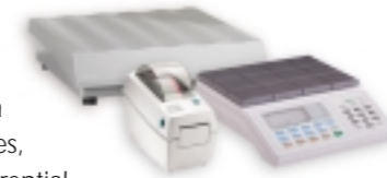
The WJ250 can interface easily with the full line of Hasler scales and weighing platforms, as well as the WJR30 Roll Tape Dispenser.

Make your mail processing even faster and more efficient by combining the WJ250 with Hasler's Dynamic Weighing Platform (WJDWP). The Dynamic Weighing Platform, with built-in size and thickness sensors, enhances the performance of the WJ250 by providing accurate and efficient processing of mixed weight mail up to 2 pounds -- at speeds up to 130 letters per minute -- it even calculates the rate for oversized mail. When operating in Dynamic or Batch modes, there is no need to sort or weigh by hand. It's fast, accurate, and fully automatic, allowing you to reduce labor costs and increase productivity with the touch of a button.